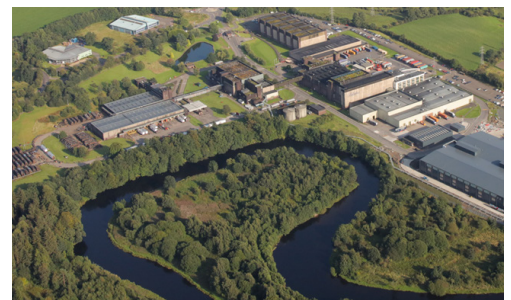
Kilmalid site, Dumbar-ton

The challenge Chivas Brothers relies on Endress+Hauser instrumentation to run its distilleries and bottling plants safely and efficiently. The company requires easy ordering of a range of devices including flowmeters, level sensors for overflow prevention, pressure transmitters and temperature probes.