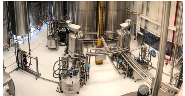
Sucroliq sugar refinement plant in Irapuato (MX)

Sucroliq has a vast experience in satisfying the different needs of their clients. With 3 facilities in Mexico, with an annual production capacity of 350,000 MT of liquid sugar, they are in the process of international growth.